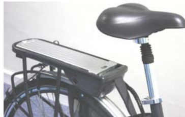
Suspension Seat Post

To improve comfort the Continental incorporates a Suspension Seat Post with quick release clamp allowing the saddle height to be easily adjusted 90cm to 104cm. The rider can also adjust the handlebar height from 105cm to 116cm thanks to a quick release stem.