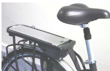
Suspension Seat Post

To improve comfort the Continental GT incorporates a Suspension Seat Post with quick release clamp allowing the saddle height to be easily adjusted 90cm to 104cm. The rider can also adjust the handlebar height from 105cm to 116cm thanks to a quick release stem.